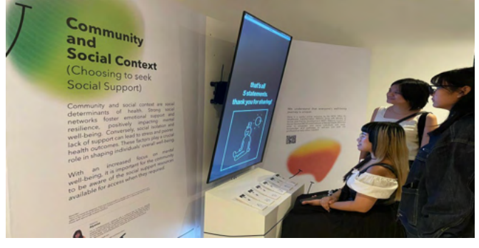
Visitors try out the "Healthier Me Happier We" interactive display.