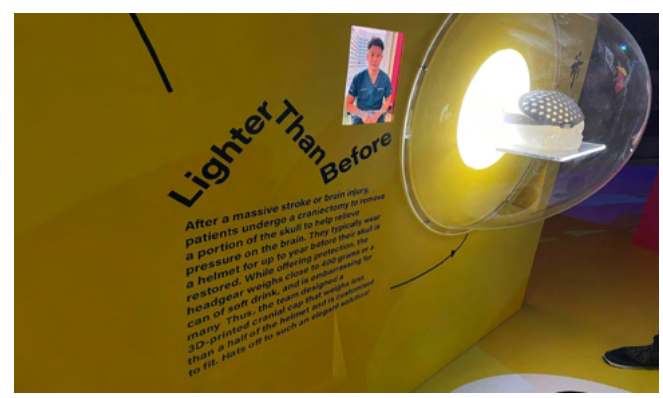
The Medical 3D printing technology on showcase.